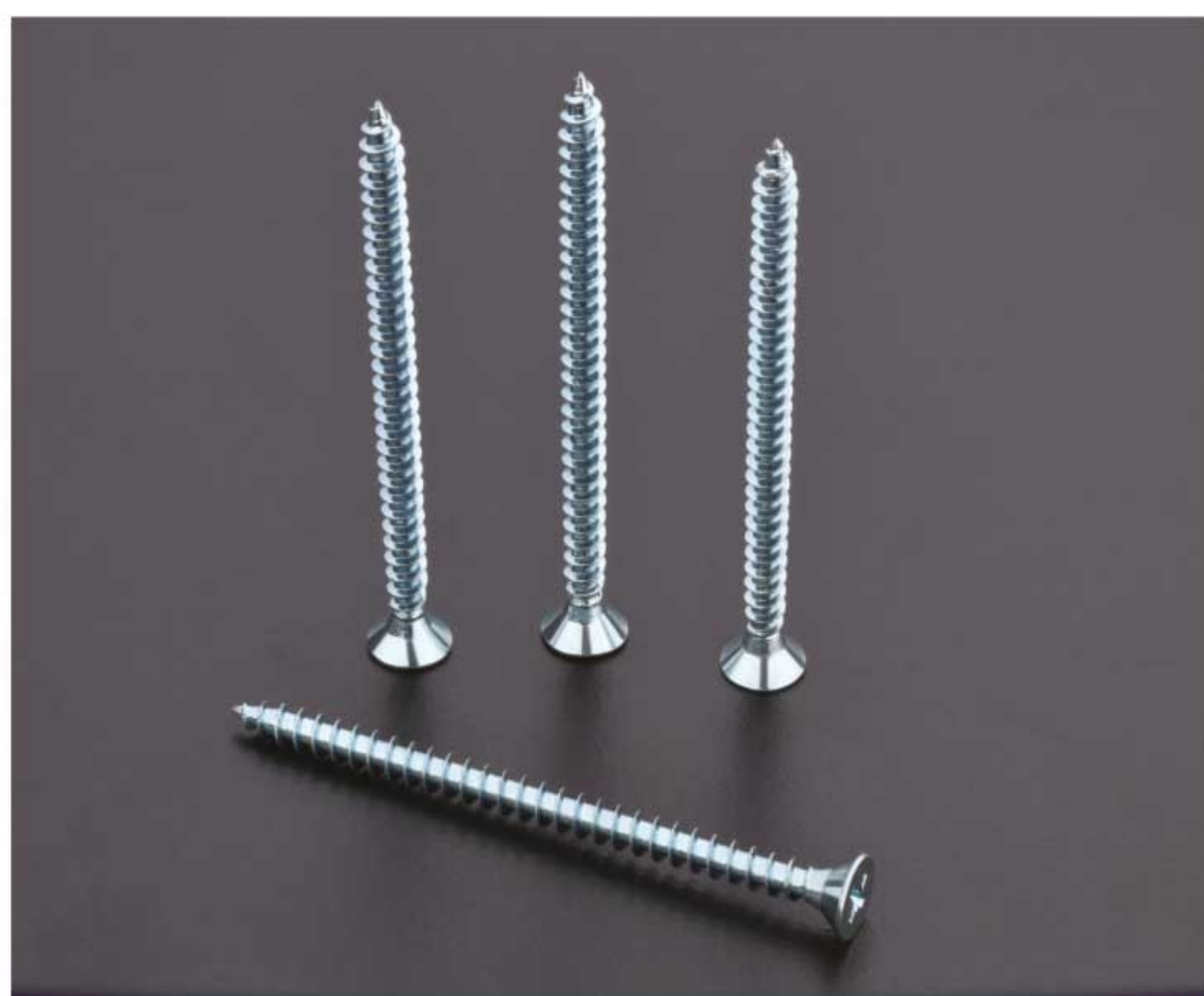
CHIPBOARD SCREWS ( FINE THREAD & SAW THREAD)