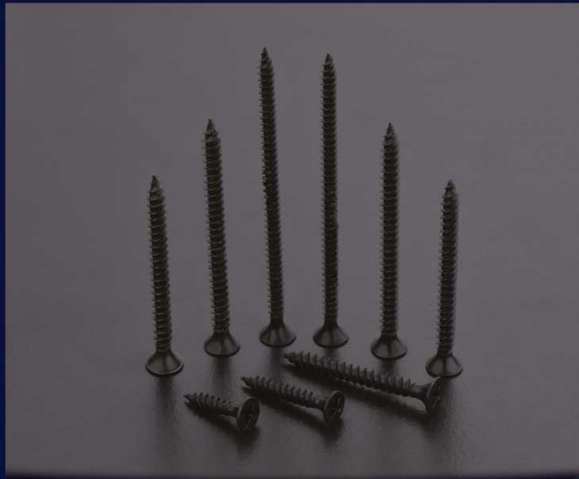
DRYWALL SCREWS (BLACK)