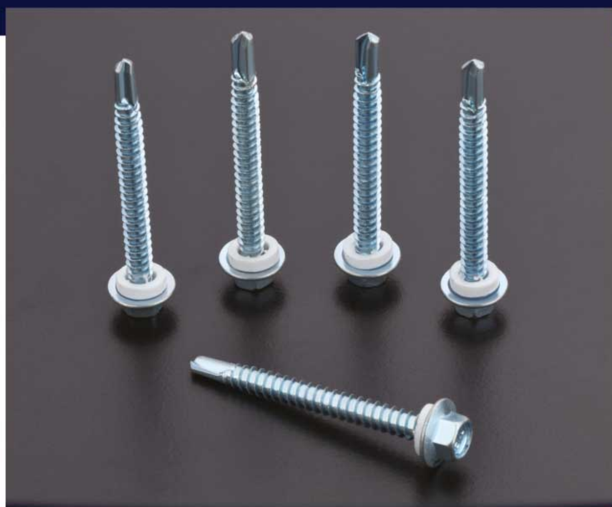
HEX HEAD SCREWS ( WHITE PVC WASHER)