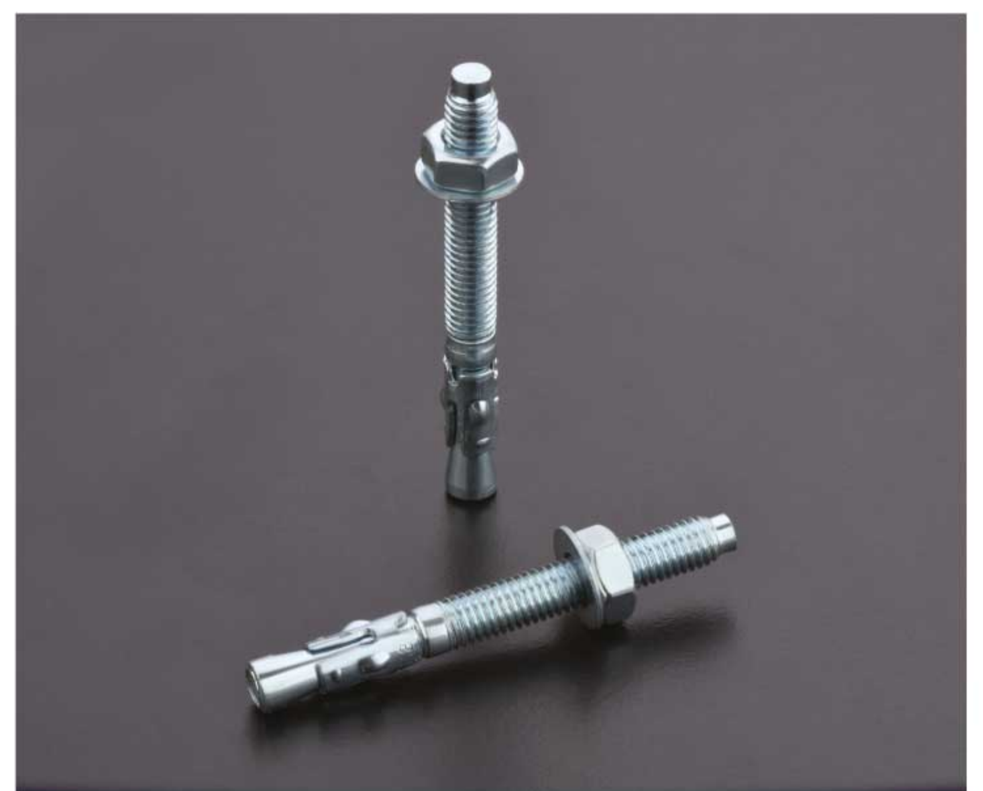
WEDGE ANCHOR FASTENERS