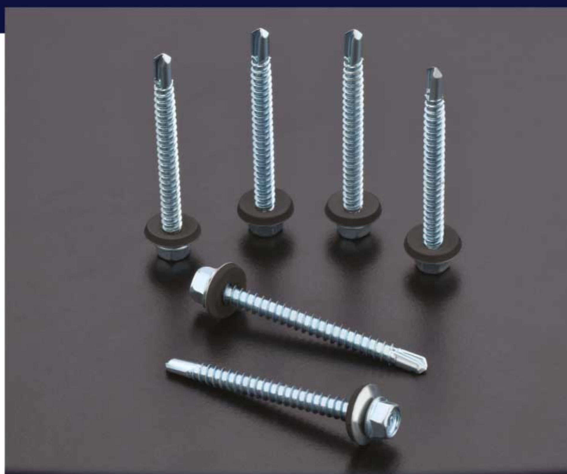
HEX HEAD SCREWS ( WITH METAL BONDED WASHER)