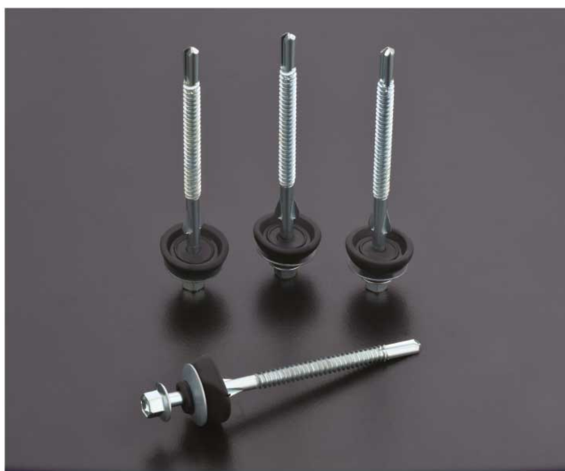
HEX HEAD CEMENT ROOFING SCREWS