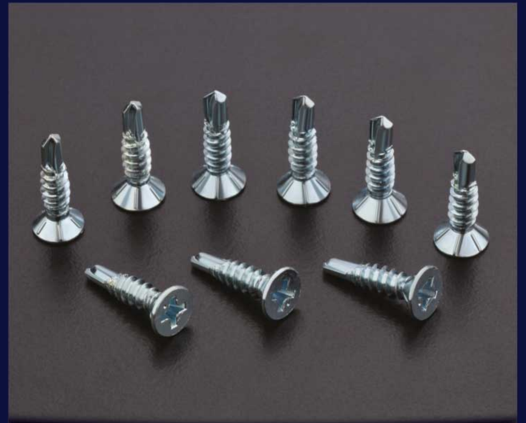
CSK SELF DRILLING SCREWS