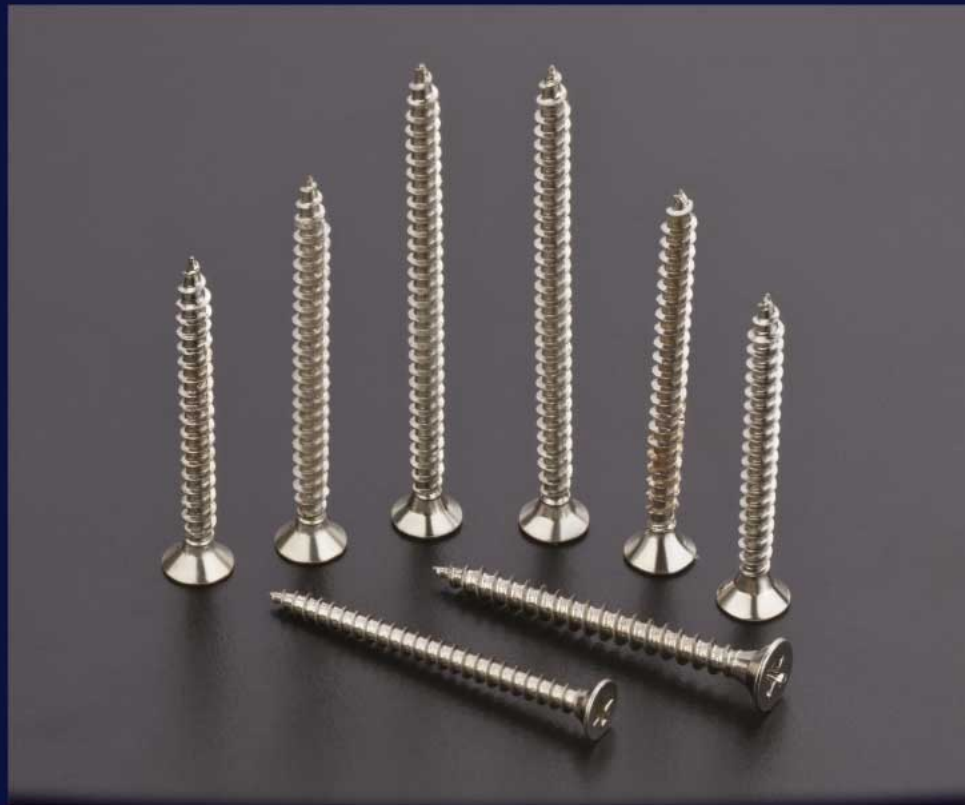
DRYWALL SCREWS (NICKEL)