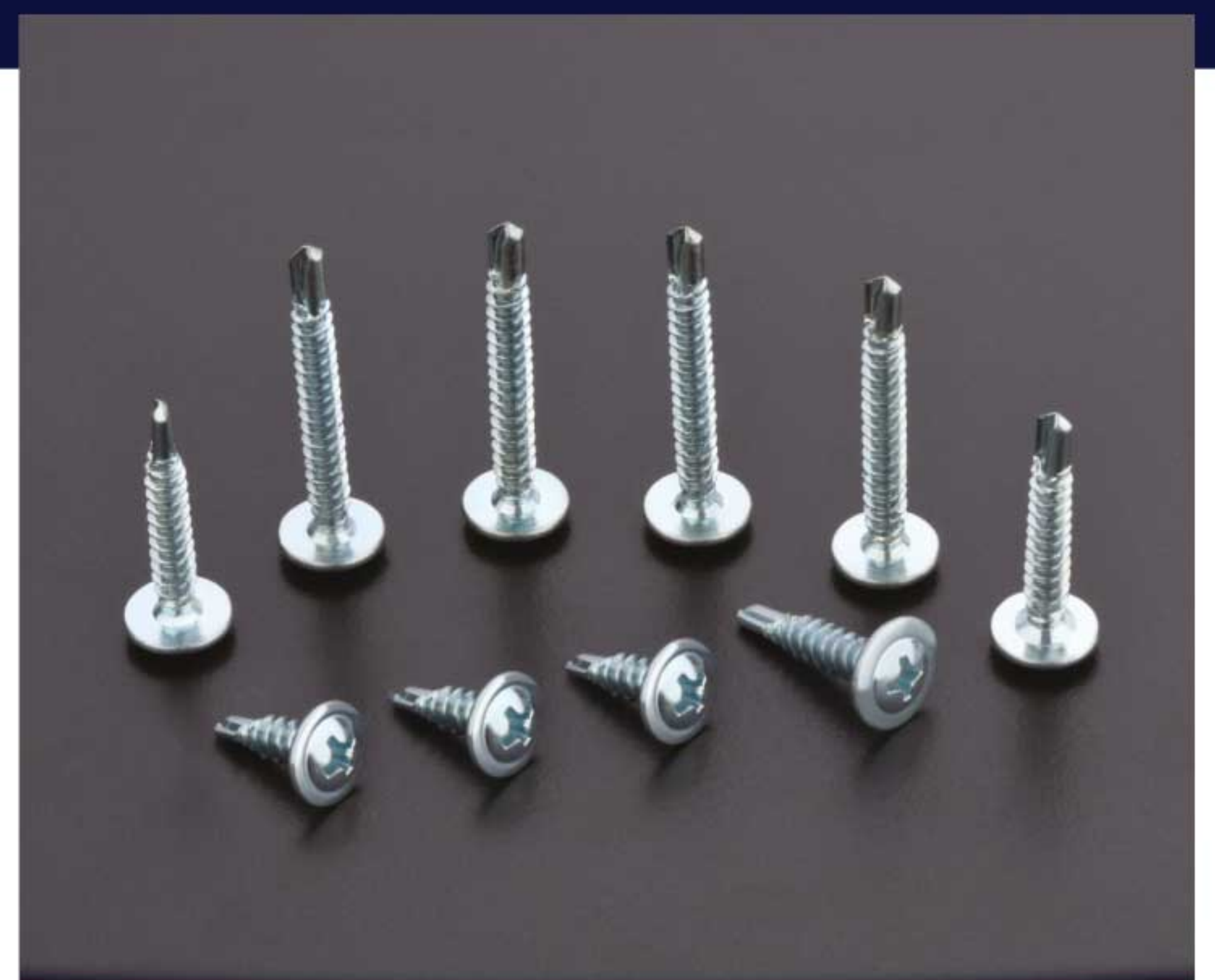
TRUSS HEAD SELF DRILLING SCREWS