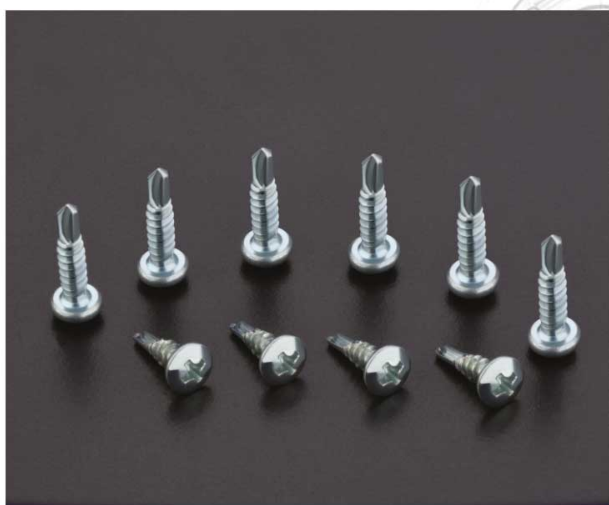
PAN HEAD SELF DRILLING SCREWS